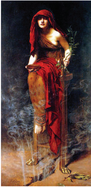
Fig. 1. Priestess of Delphi by John Collier (1891). Pythia is depicted in a trance state as she inhales vapors rising from the fissure underneath. This image is in the public domain.

likely that the sweet pneuma was ethylene, which transported the Oracle to her psychedelic states.